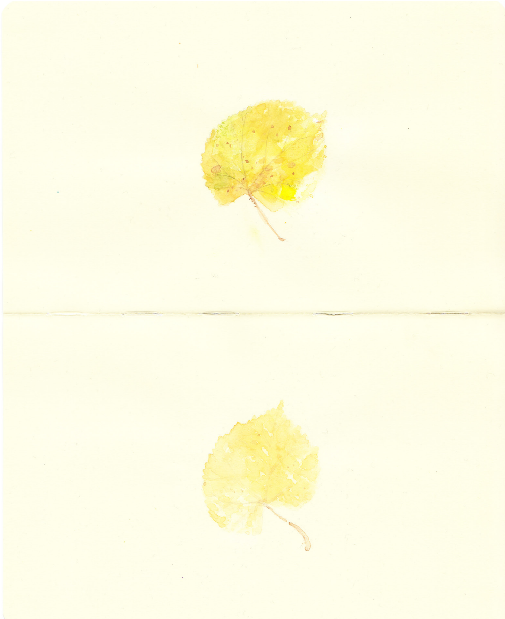
Leaves of a silver linden tree, Pencil and watercolour on paper, 20,5 x 25 cm, 2013