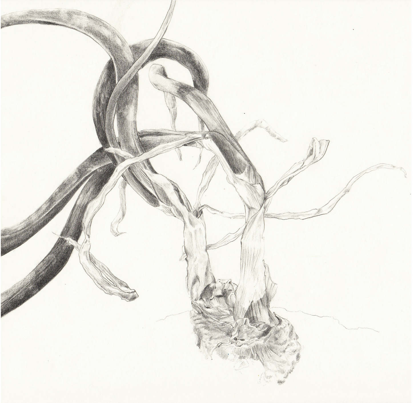
Onion, Pencil on paper, 20 x 25 cm, 2003