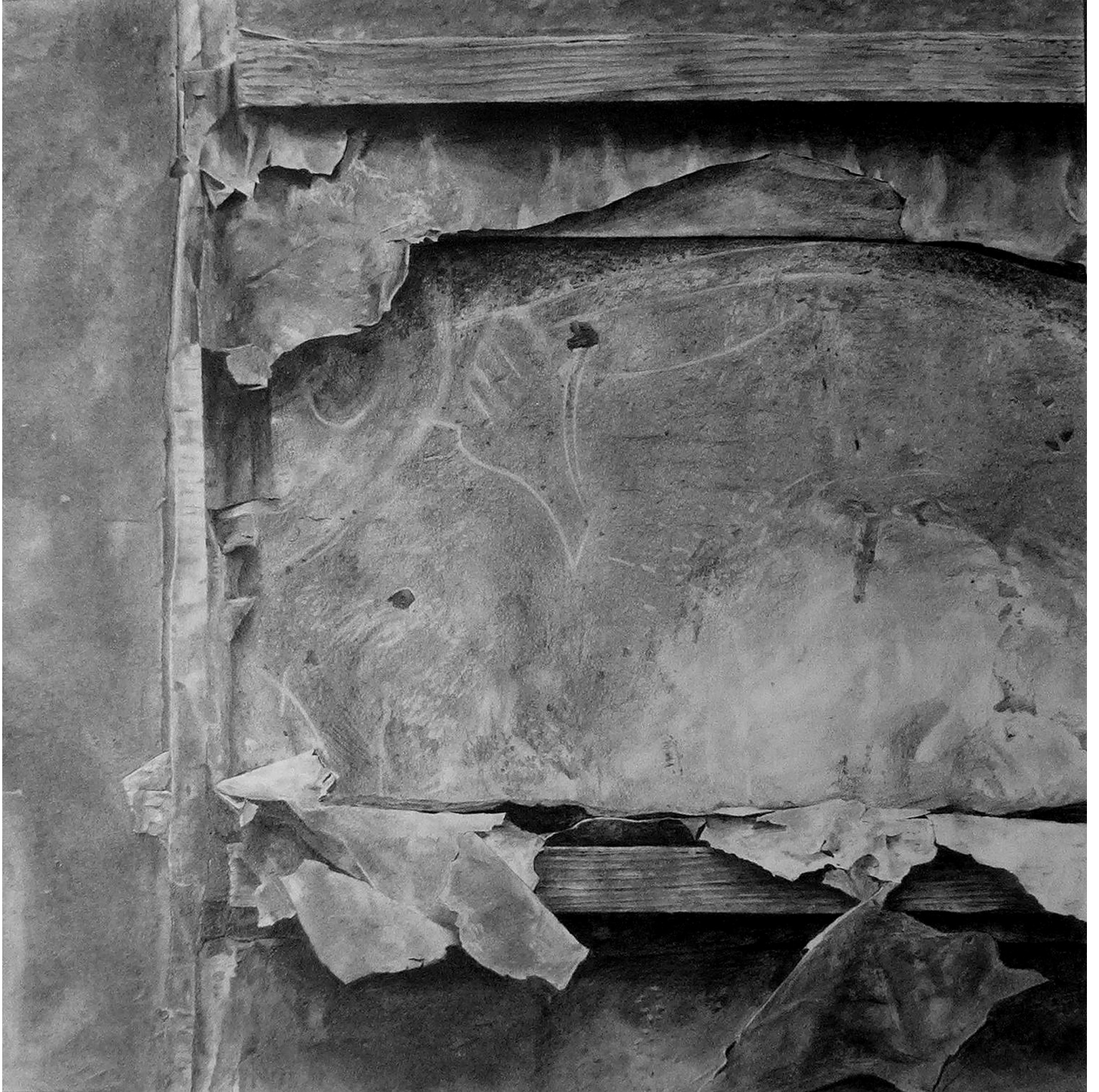
Wall, Pencil on paper, 50 x 50 cm, 2005