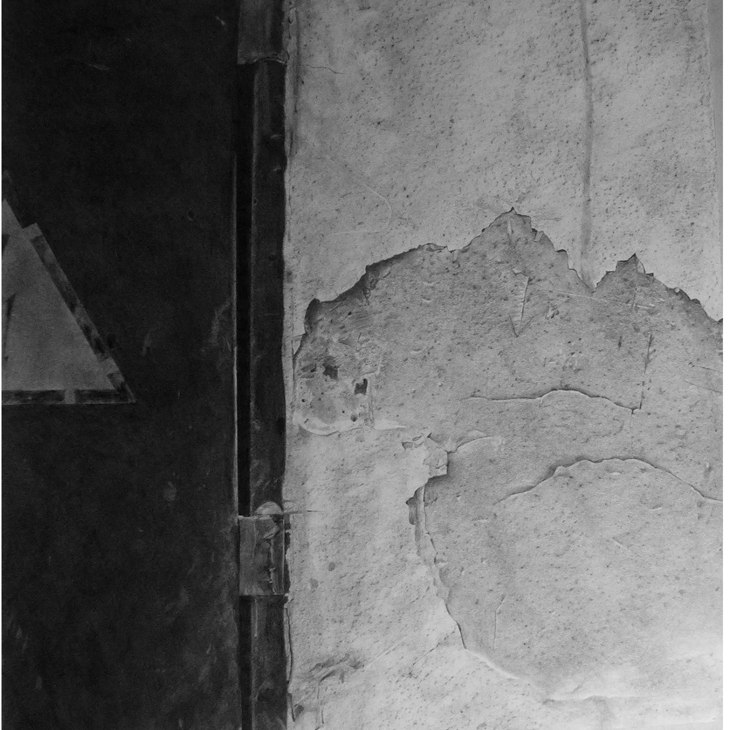
Wall, Pencil on paper, 50 x 50 cm, 2005