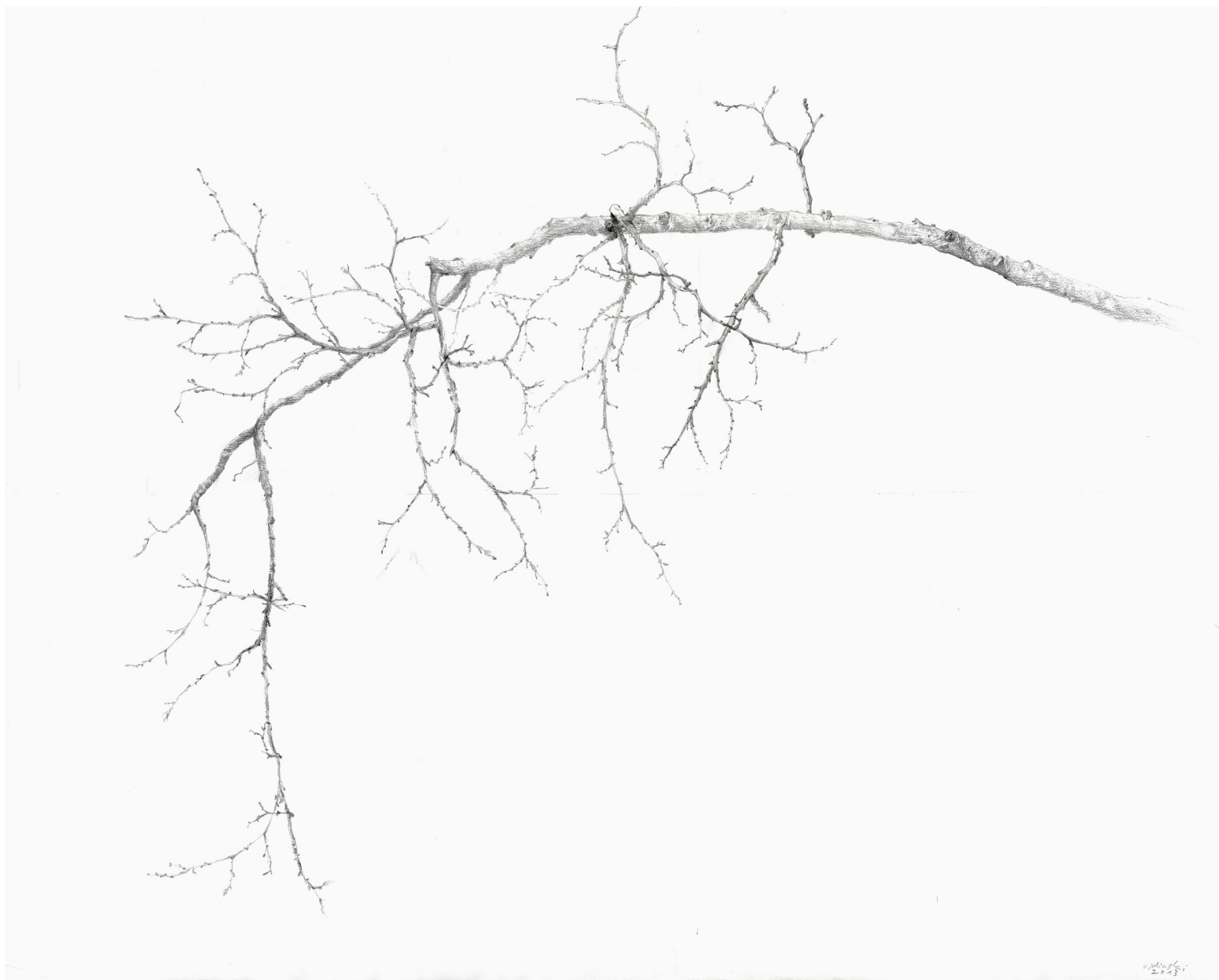
Branch of a birch tree, Winter, Pencil on paper, 69 x 88 cm, 2013