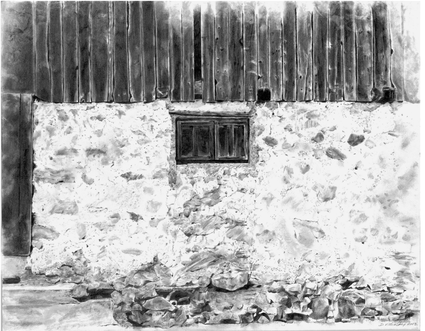
Weißensee, Austria, 38 x 48 cm, Pencil on paper, 2003