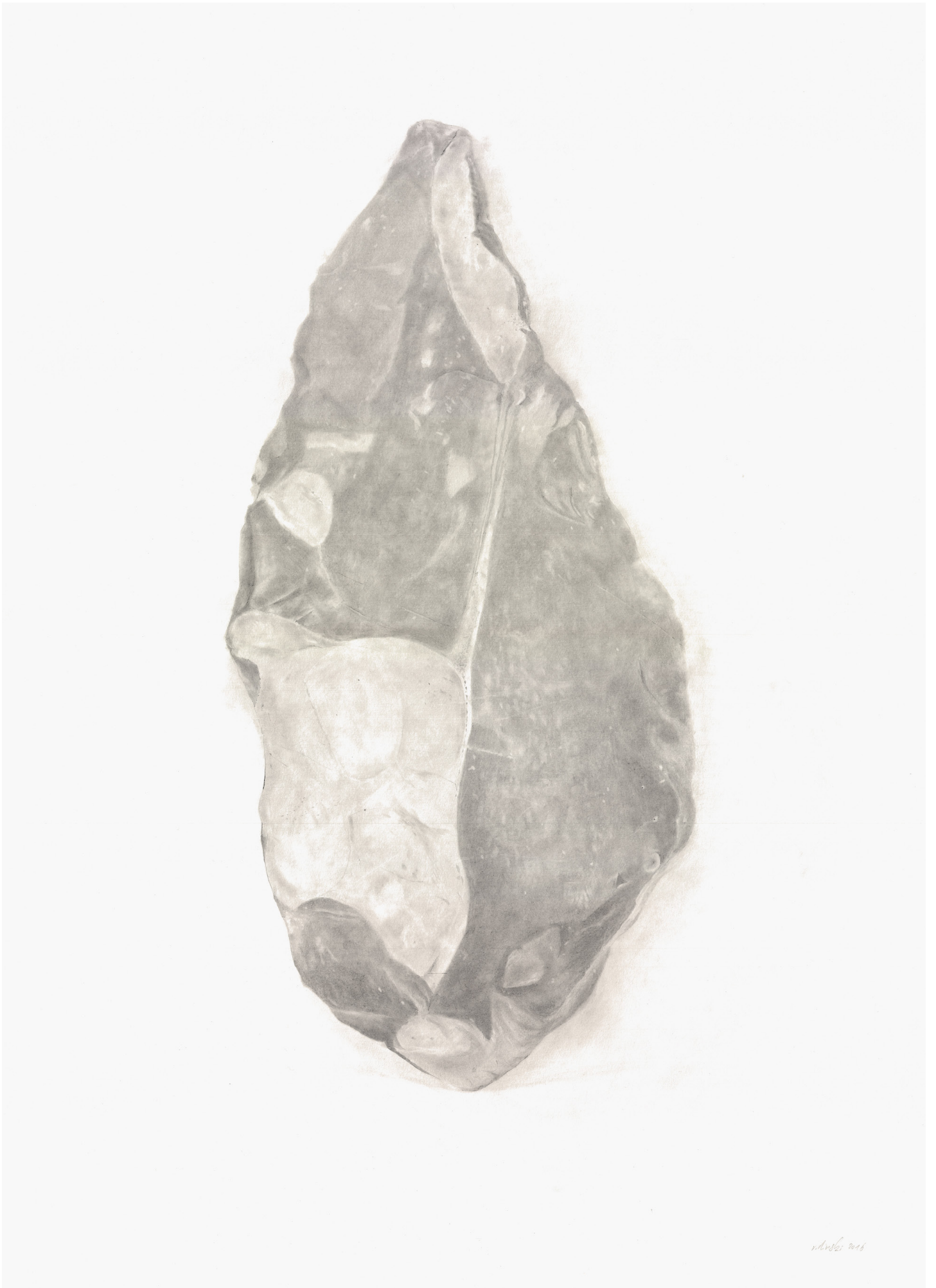
Flintstone, Pencil on paper, 100 x 70 cm, 2016