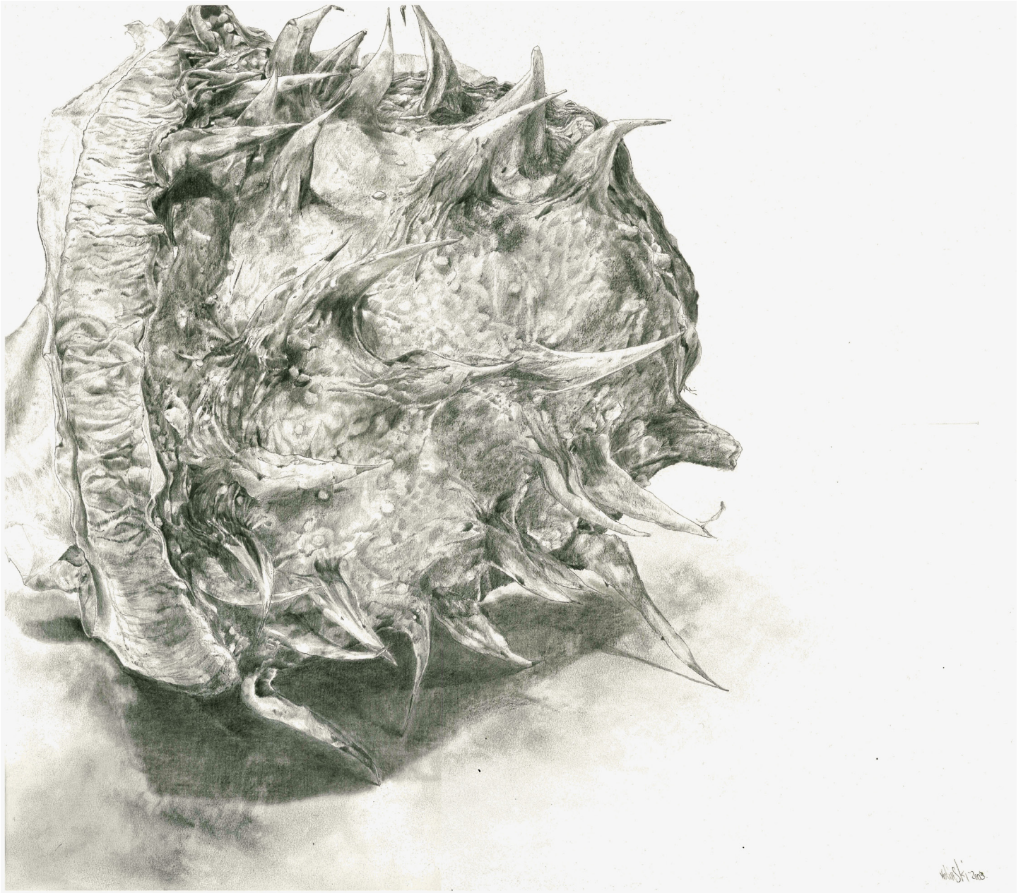
Shell of a chestnut, 50 x 50 cm, Pencil on paper, 2003