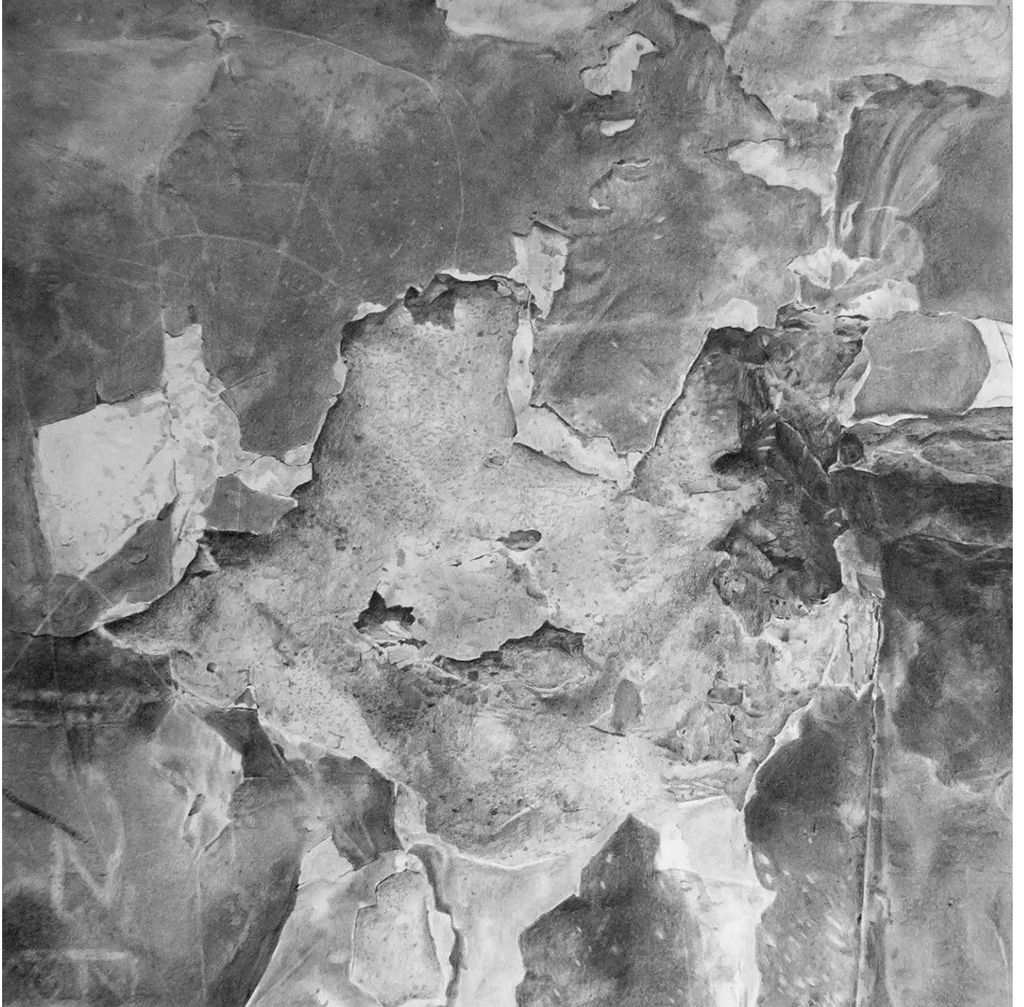
Wall, Pencil on paper, 50 x 50 cm, 2005