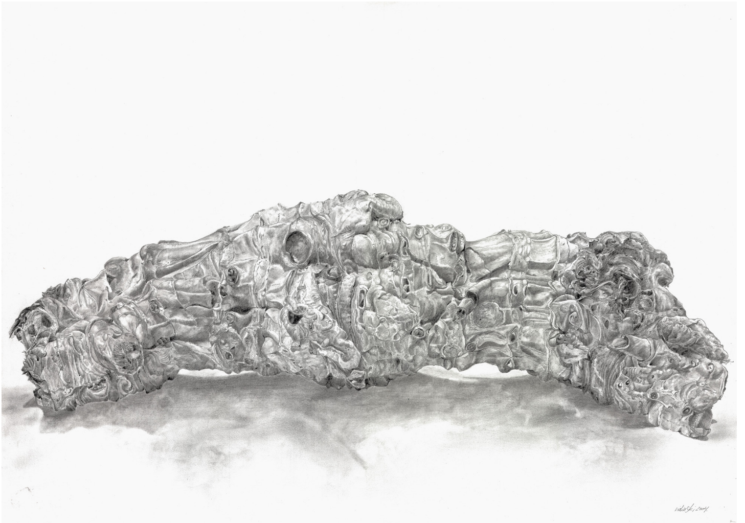
Driftwood, Pencil on paper, 100 x 70 cm, 2004