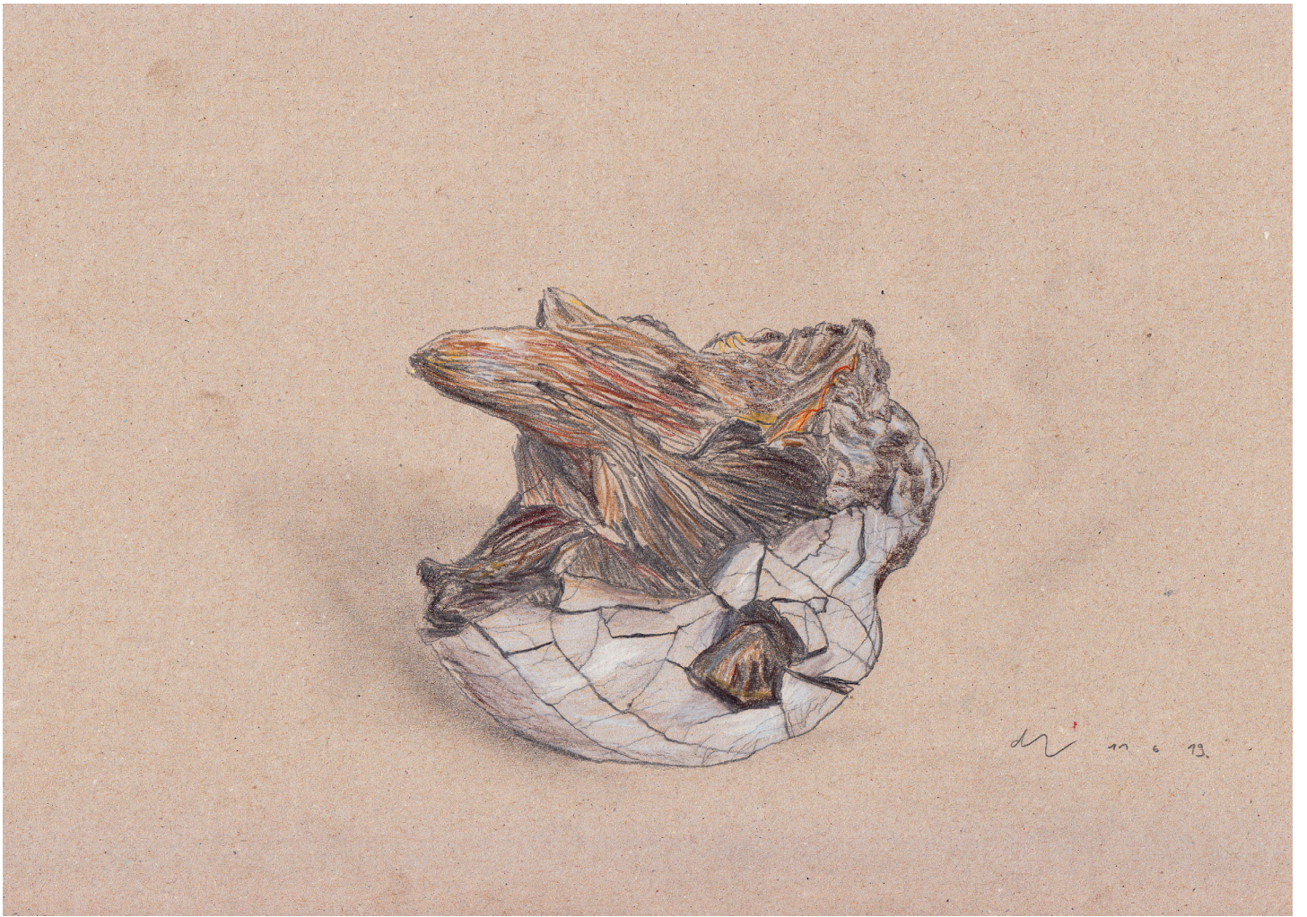
Tree fungus, Pencil and coloured pencil on paper, 21 x 29,7 cm, 2019