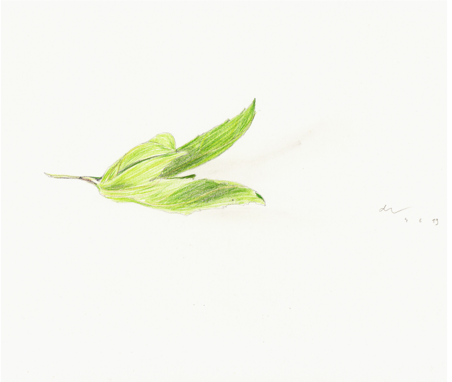
Fruit of a hornbeam, Pencil and coloured pencil on paper, 21 x 29,7 cm, 2019