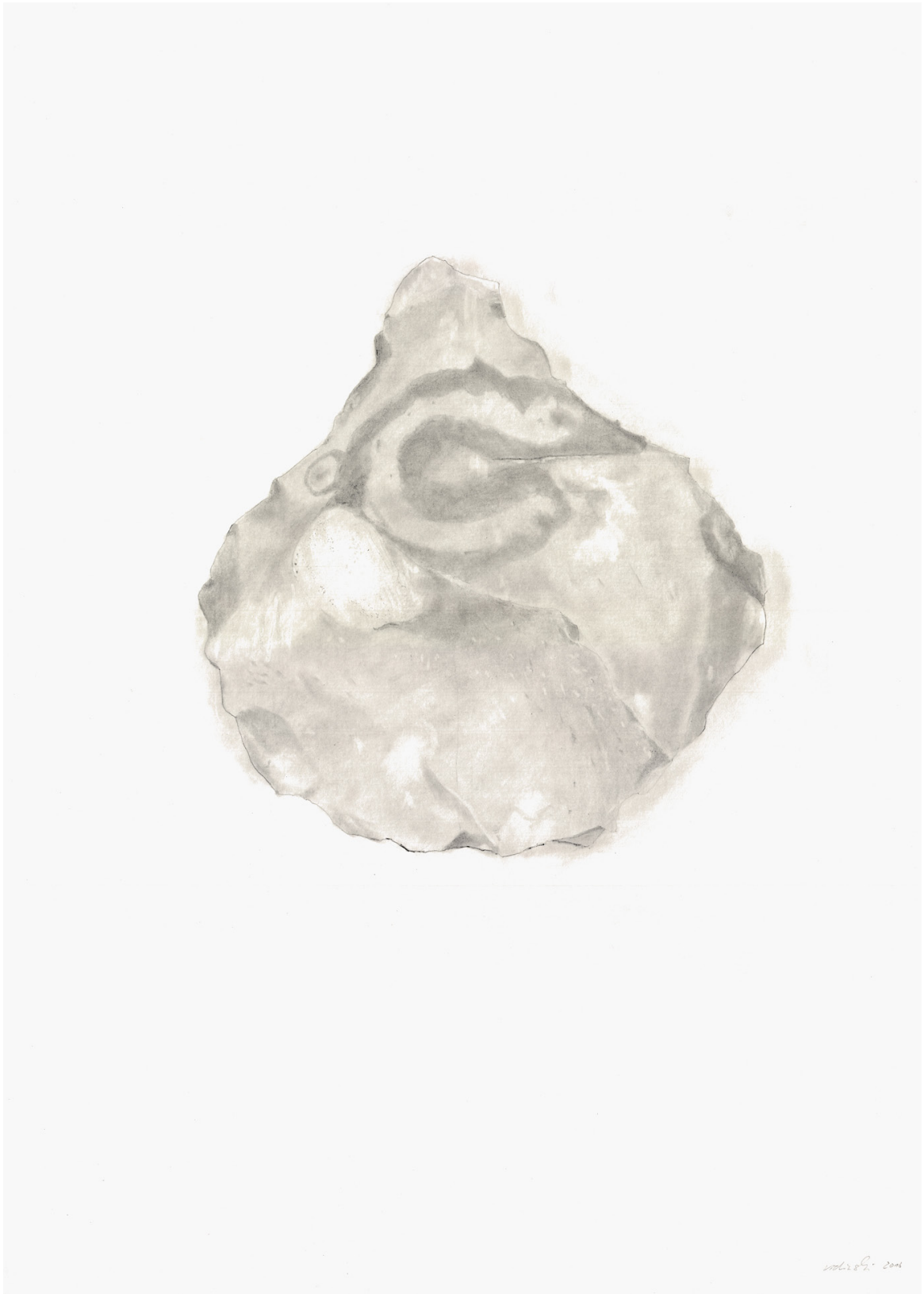
Flintstone, Pencil on paper, 70 x 50 cm, 2016